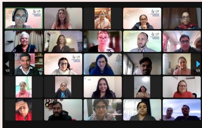
Participants from all over the world joined the conversation